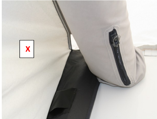
Incorrect position of Air Beam

Assemble the two Easy Alloy “back poles” and fit the blanked end of the pole into the small black pocket on the “packer”, located down the side of the caravan. Ensure that the packer itself is lying flat against the caravan. The AiR tube must be fully into the top corner of the awning with the packer lying flat between the caravan and AiR tube and the Velcro strips are the very top attached. As shown in the photos below.