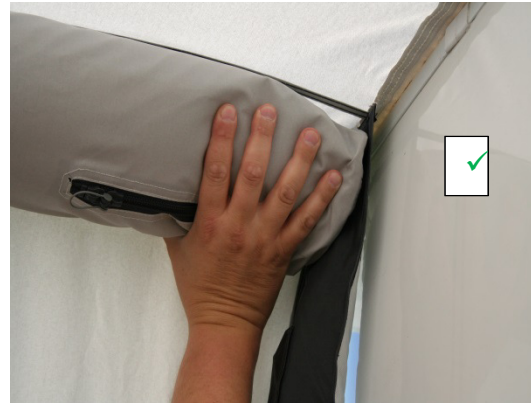
Correct position of Air Beam

IMPORTANT The foot of the “back pole” should be inserted into a pegging ladder at the base of the packer. By doing this, you will get much better tension and a much better overall appearance of the awning. As mentioned previously, there are 2 sewn-in ladder clips at this point. One to peg to the ground with and the other for this pole. See diagram 2 on page 2. Apply a small amount of vertical tension to the pole from the ground upwards, to hold the packer against the caravan. (Too much tension here will damage the pocket into which the pole is fitted. Please make sure the pole is not extended further than the height of the pocket). Tie the pole in position with the ties provided.